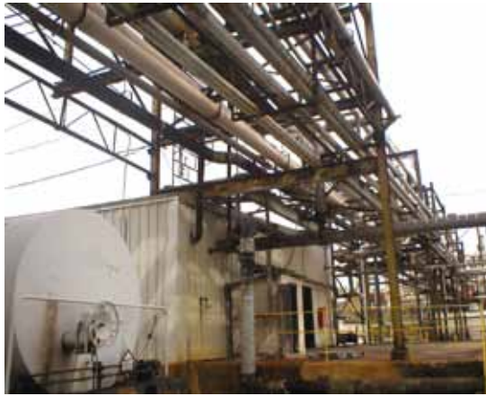
Steam tracing will keep pipes like these from freezing during cold months.

The simplest, least expensive method for controlling steam through trace lines is by utilizing self operating valves that respond to ambient temperature. Therm-Omega-Tech's Ambient Sensing valves operate utilizing our Thermoloid® solid-liquid phase change actuators. The Thermoloid® material responds only to temperature change. The expansion and contractions of this material during phase change opens and closes valves with no other source of power required.