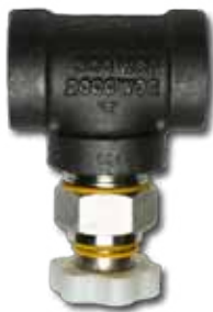
DL Type T