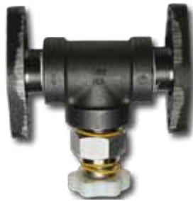
DL Type FL