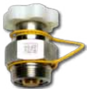
DL Type S