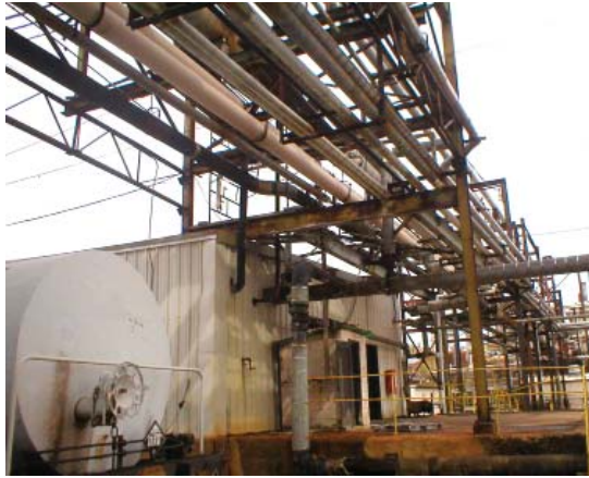
Steam tracing will keep pipes like these from freezing during cold months.

The simplest, least expensive method for controlling steam through trace lines is by utilizing self operating valves that respond to ambient temperature. Therm-Omega-Tech's Ambient Sensing valves operate utilizing our Thermoloid® solid-liquid phase change actuators. The Thermoloid® material responds only to temperature change. The expansion and contractions of this material during phase change opens and closes valves with no other source of power required.