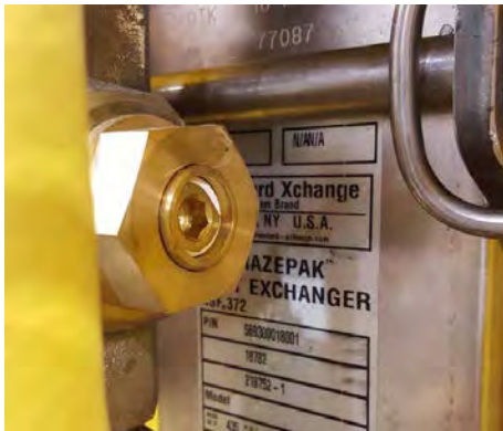
V3 INDICATOR CLOSED POSITION