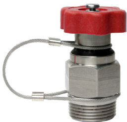
Type-S - Standard Plug

All GURU® plugs are also available with anti-tamper domed caps to prevent tampering with the valve resetting stem.