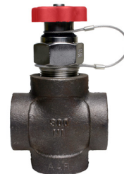
Type CR - Cross Body