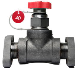
Type-FL or Type-FL-GX or Type-FL/FL-GX