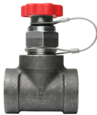
Type-T - Tee Body